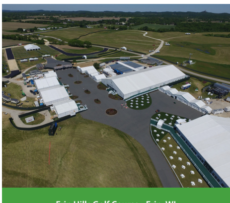
Erin Hills Golf Course • Erin, WI