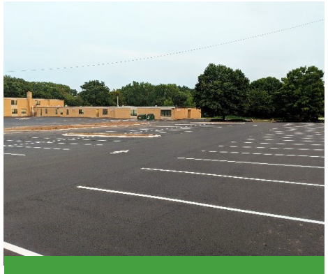
Green Bay Area Public Schools • Green Bay, WI