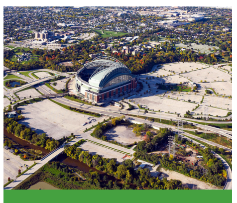
Miller Park • Milwaukee, WI