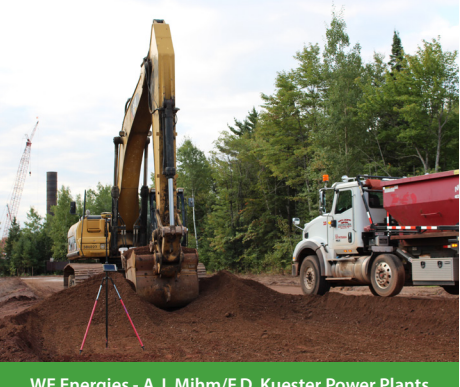
WE Energies - A.J. Mihm/F.D. Kuester Power Plants Marguette County, MI