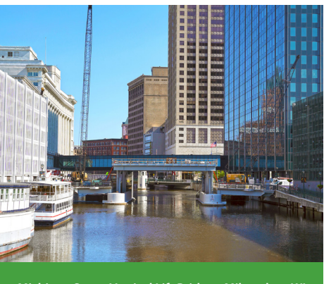
Michigan Street Vertical Lift Bridge • Milwaukee, WI