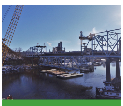
Red Wing Eisenhower Bridge of Valor • Red Wing, MN